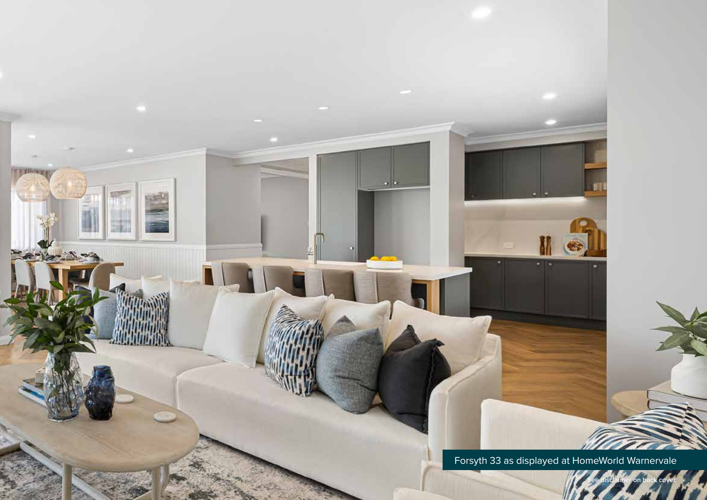
Forsyth 33 as displayed at HomeWorld Warnervale