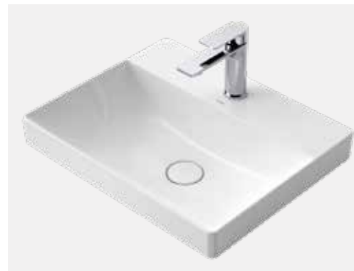
Caroma Urbane II Inset Vitreous China Vanity Basin