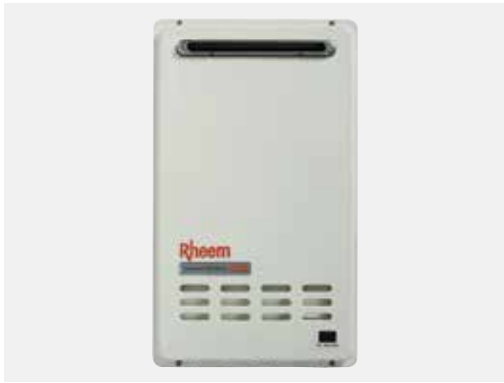
6 Star Rheem Instantaneous Gas Hot Water System