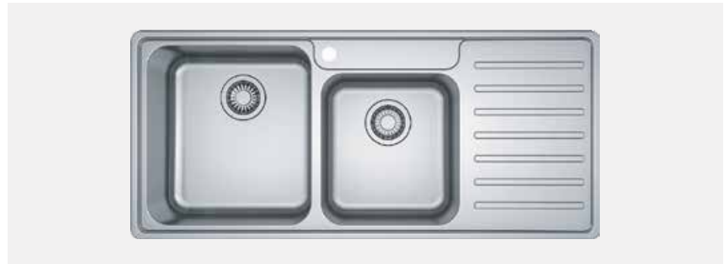
Franke 1 ¾ kitchen sink