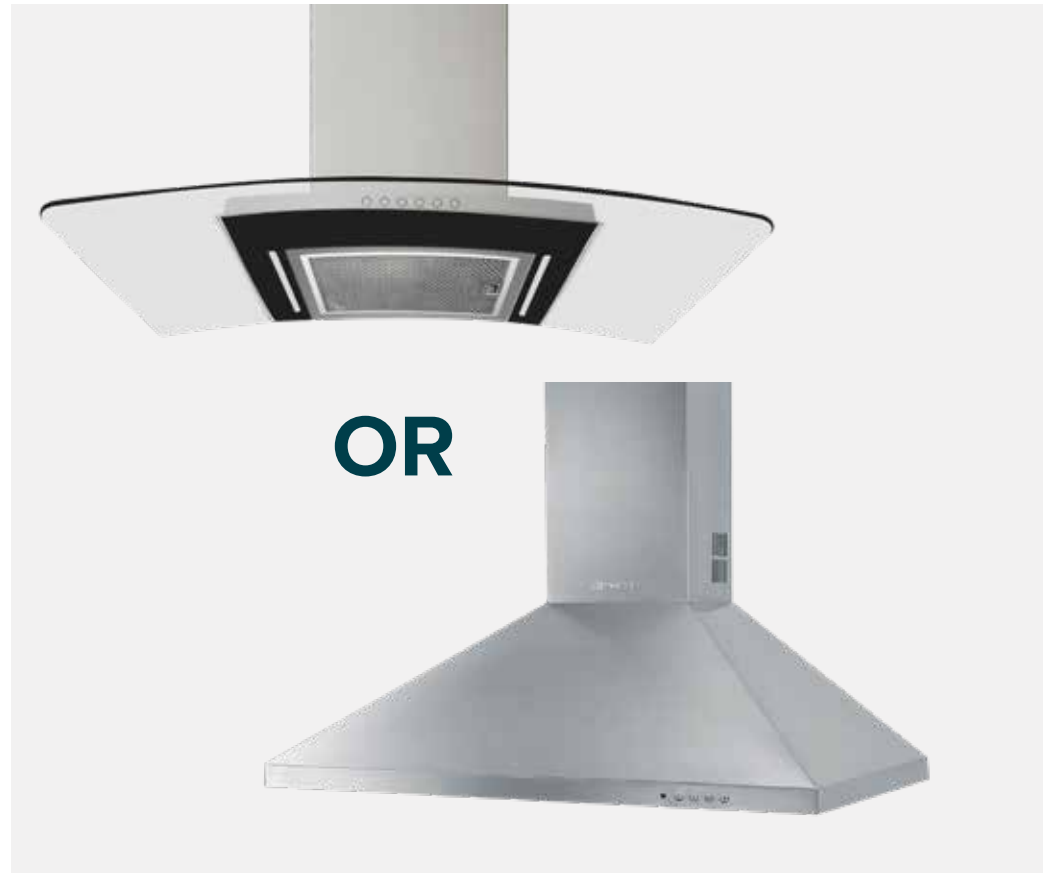
Choice of SMEG 900mm Stainless Steel Canopy or SMEG 900mm Glass Canopy Rangehood