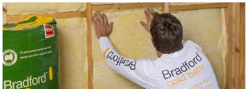
Bradford 2.5 Glass Wool Wall Insulation Batts to External Walls