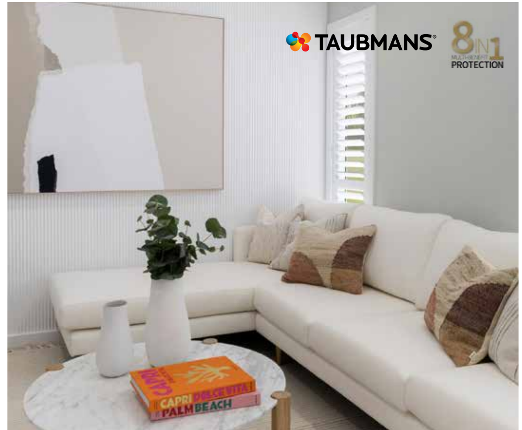
Taubmans Endure 8-in-1 Multi Benefit Paint System