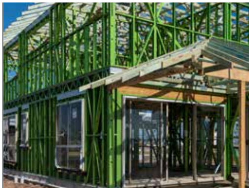
Termite Resistant Framing