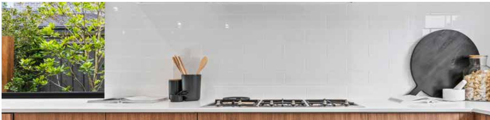
Ceramic Tiled Splashback from selected range