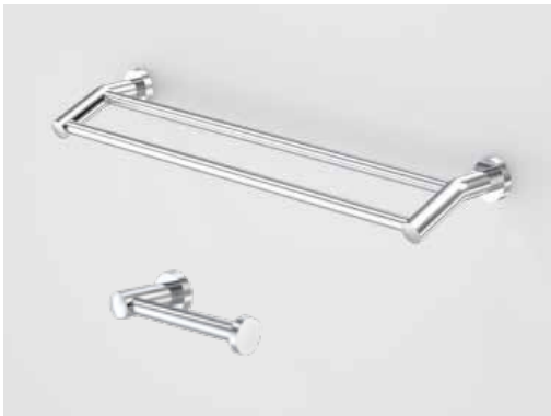
Caroma Cosmo Range Accessories to Ensuite, Bathroom & Powder Room (if applicable)