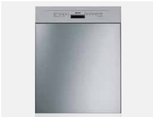
SMEG 600mm Stainless Steel Dishwasher