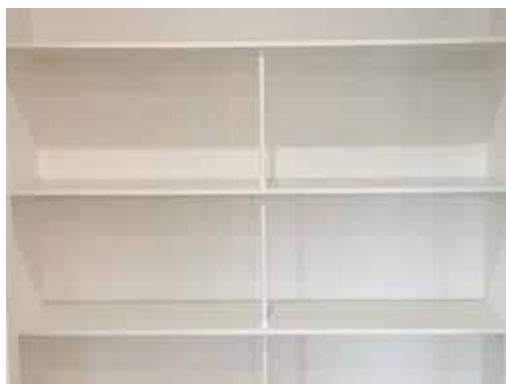
White melamine shelving to pantry