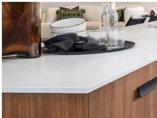
20mm Stone Benchtop to Kitchen in a range of selected colours