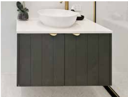
Choice of Floating or Semi Floating Vanity