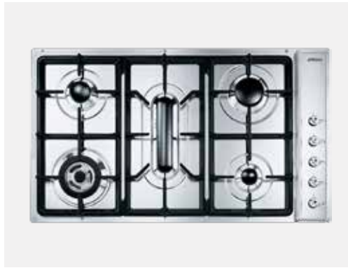
SMEG 900mm Stainless Steel 5 Burner Gas Cooktop