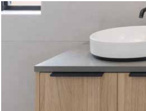
20mm Stone Benchtop to Ensuite, Bathroom & Powder Room (if applicable)