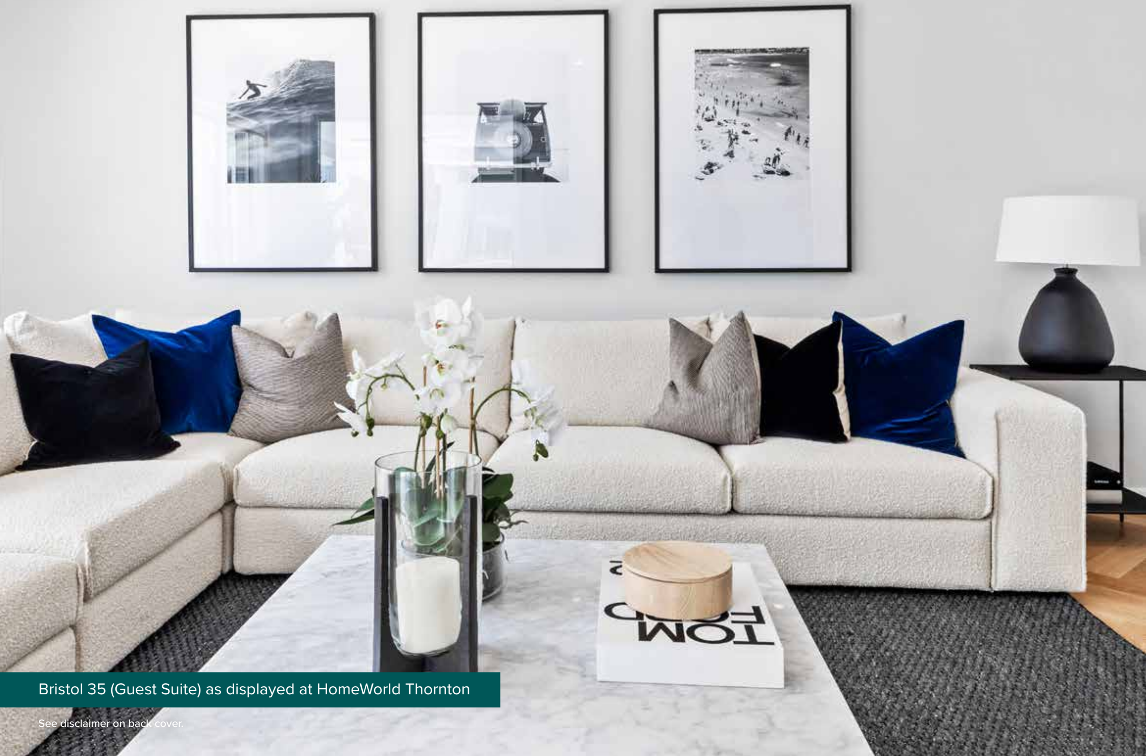
Bristol 35 (Guest Suite) as displayed at HomeWorld Thornton