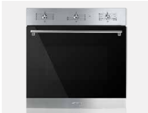
SMEG 600mm Stainless Steel Underbench Oven