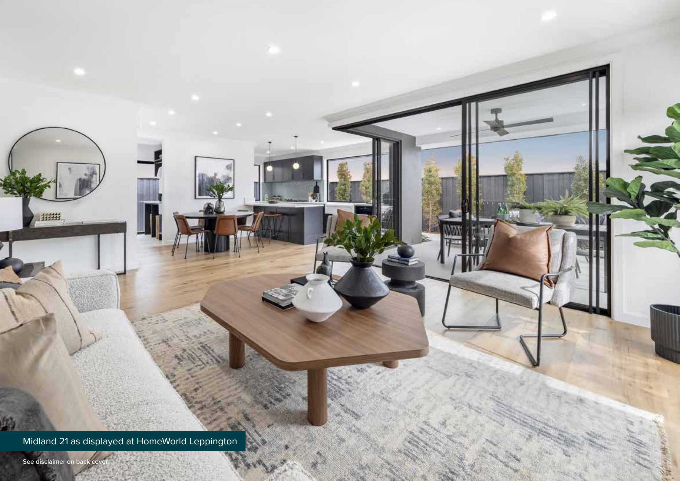
Midland 21 as displayed at HomeWorld Leppington