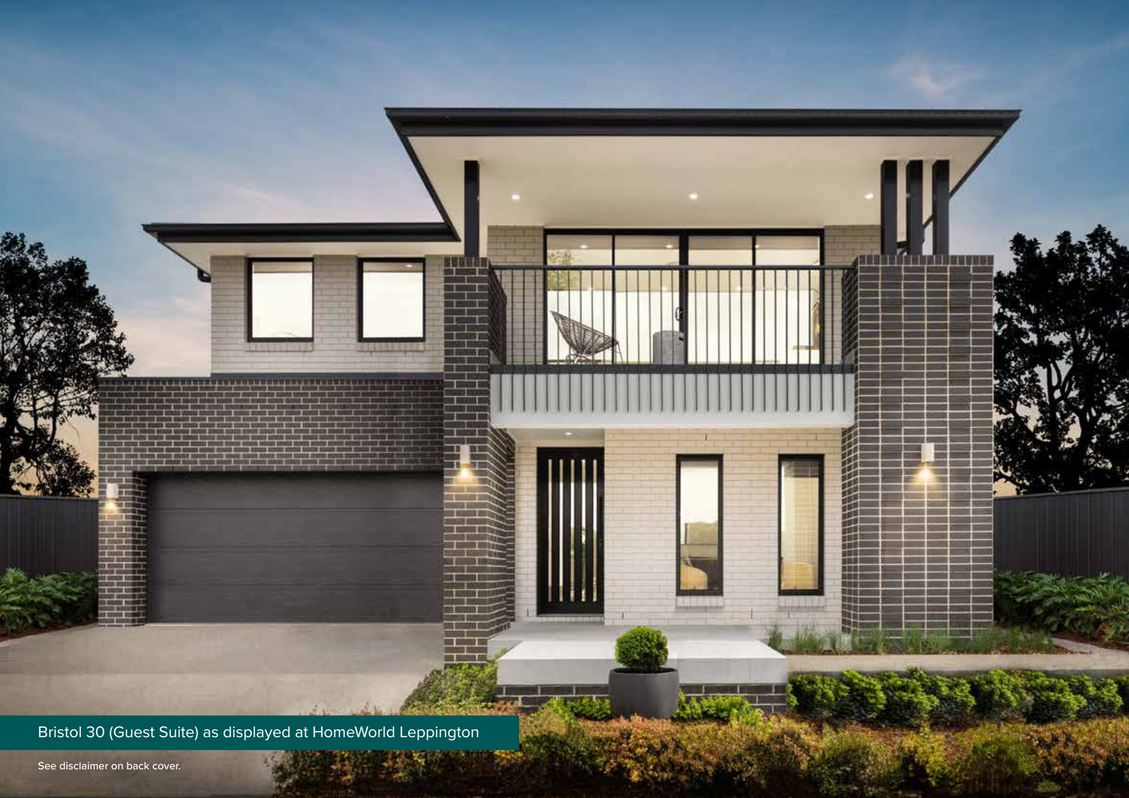
Bristol 30 (Guest Suite) as displayed at HomeWorld Leppington