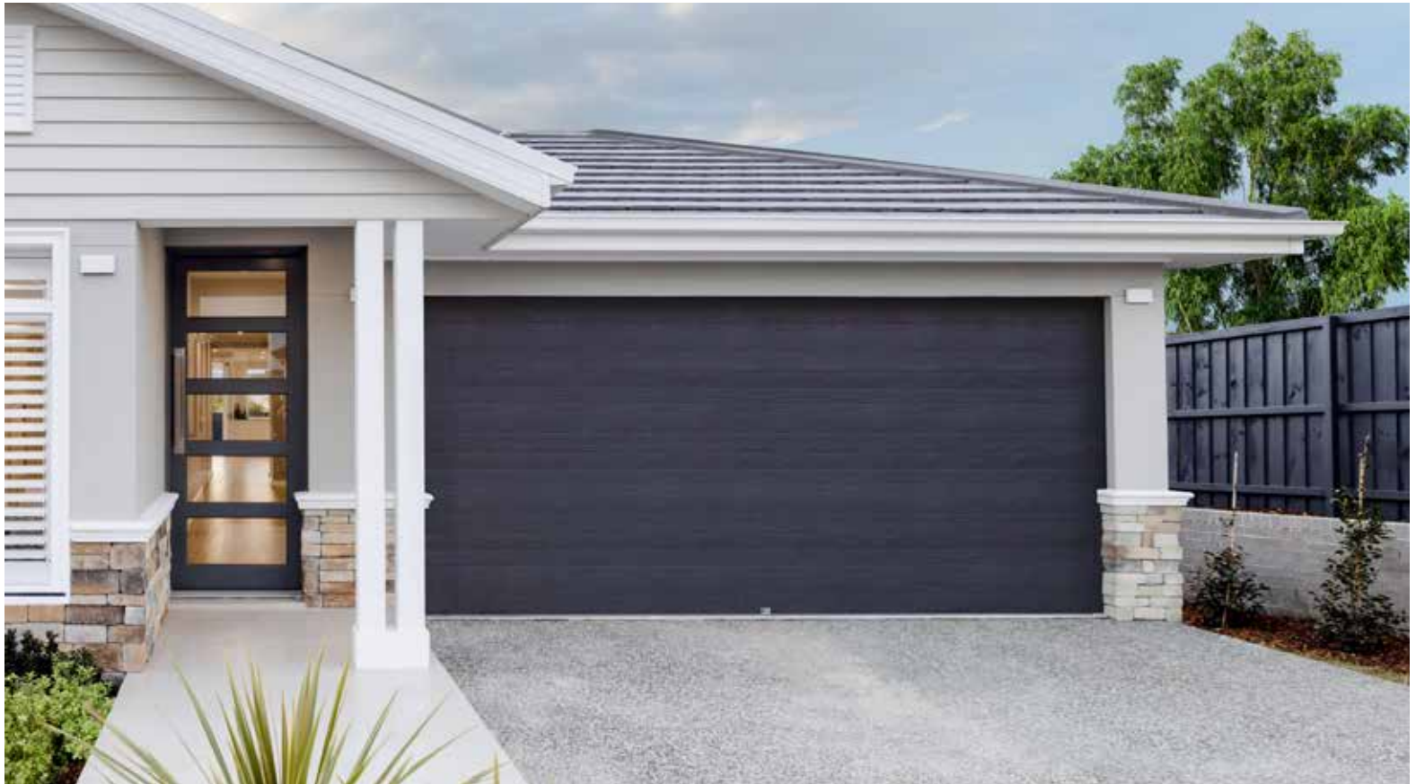
Sectional Garage Door in Selected Colorbond® Colours