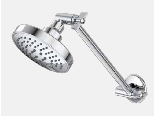
Caroma Luna Adjustable Wall Shower to Bathroom