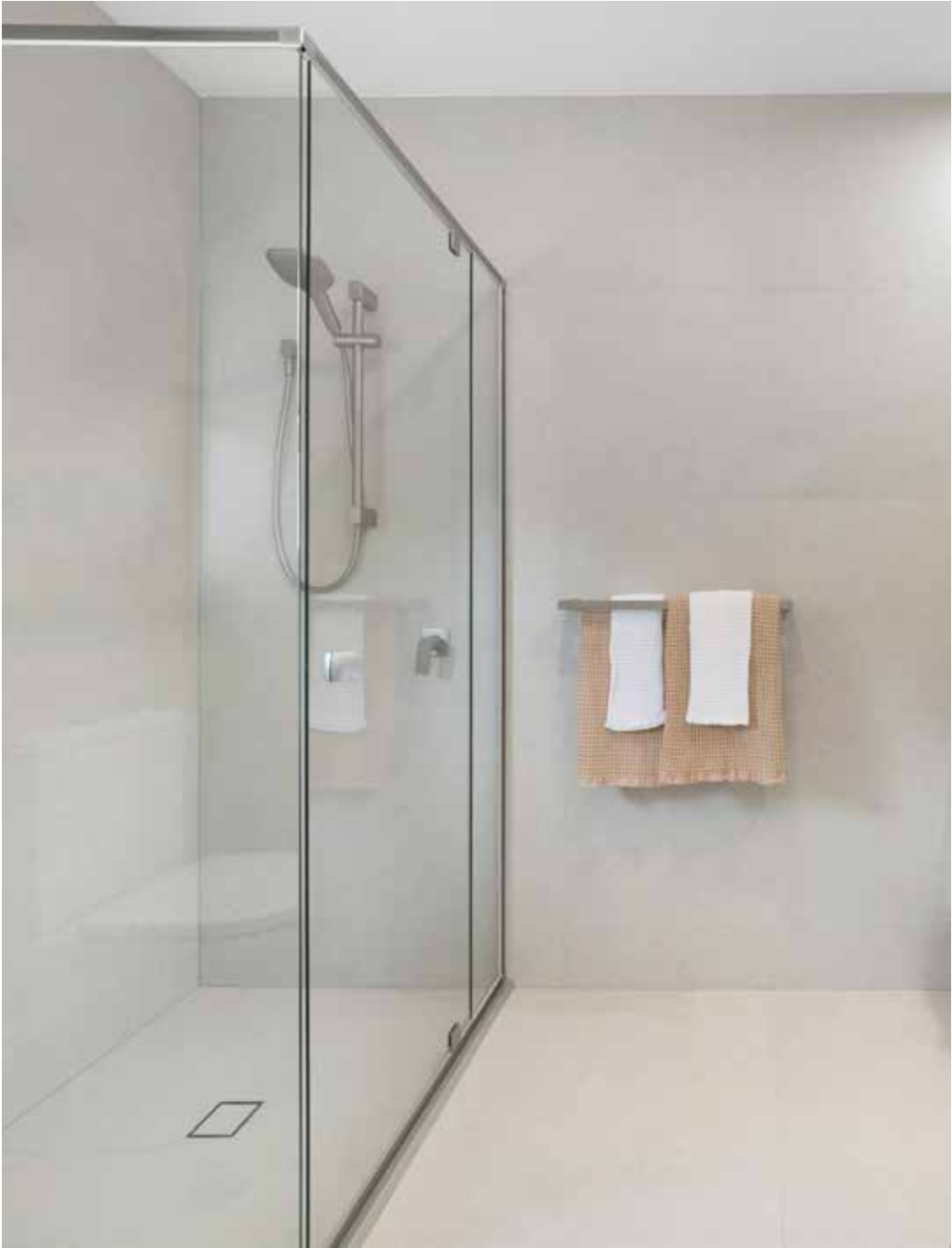
Aqua Overlap Semi-Frameless Shower Screen