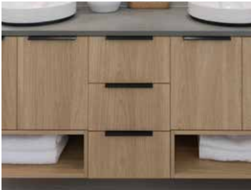
Choice of Designer Handles from Selected Builders Range