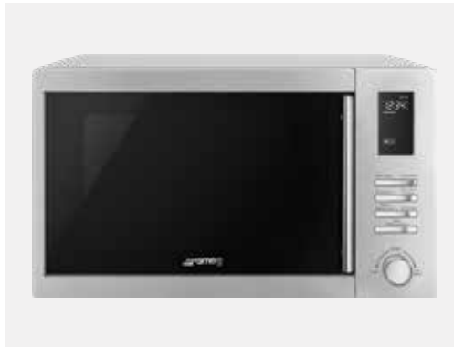
SMEG Stainless Steel Microwave Oven with Grill