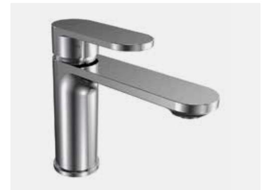
Parisi Elli II Basin Mixer to Ensuite, Bathroom & Powder Room (if applicable)