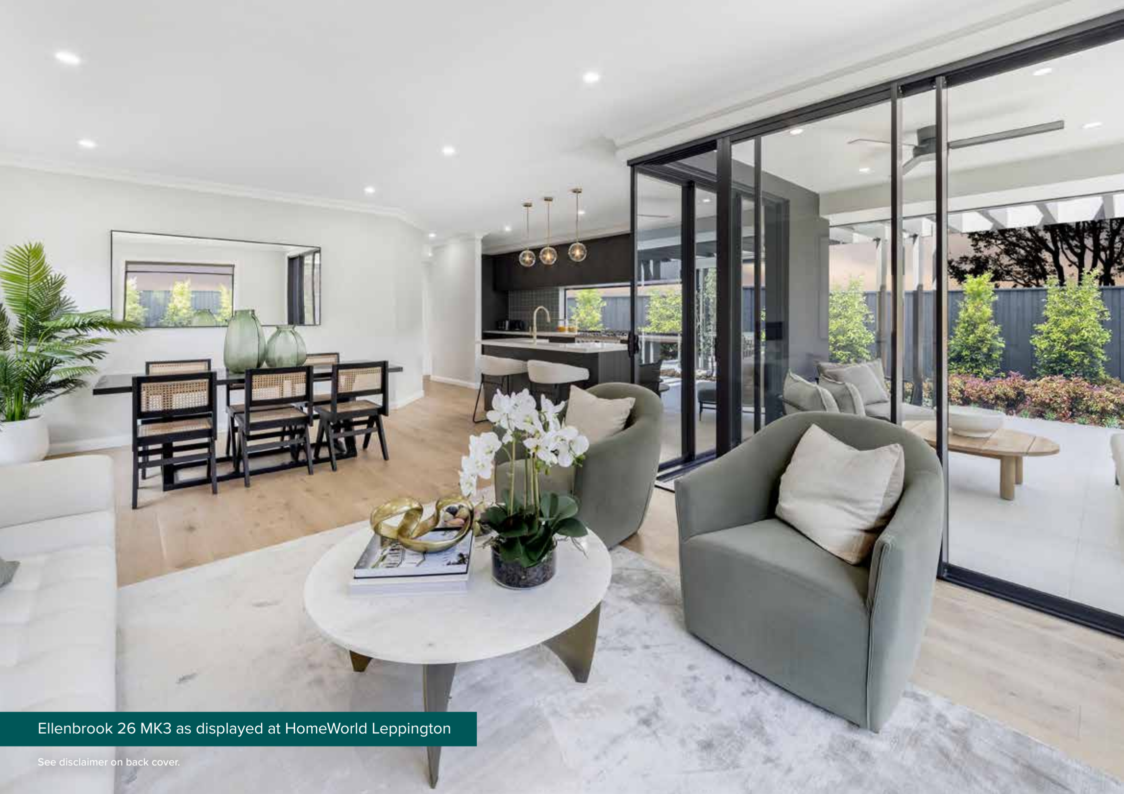
Ellenbrook 26 MK3 as displayed at HomeWorld Leppington