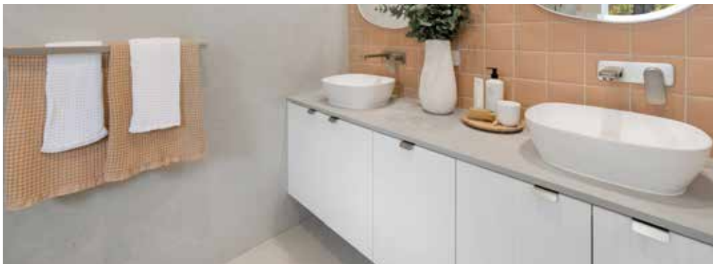
Range of Laminate Finishes to Vanity Unit