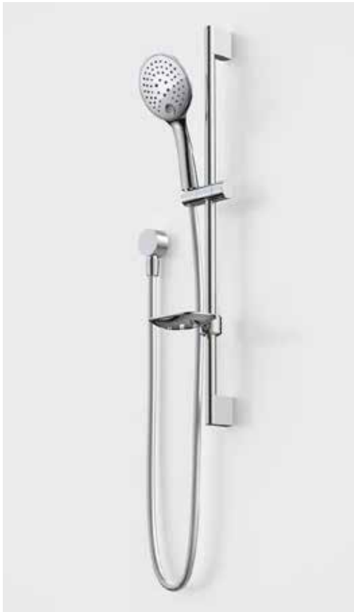
Caroma Pin Multifunction Shower Rail to Ensuite