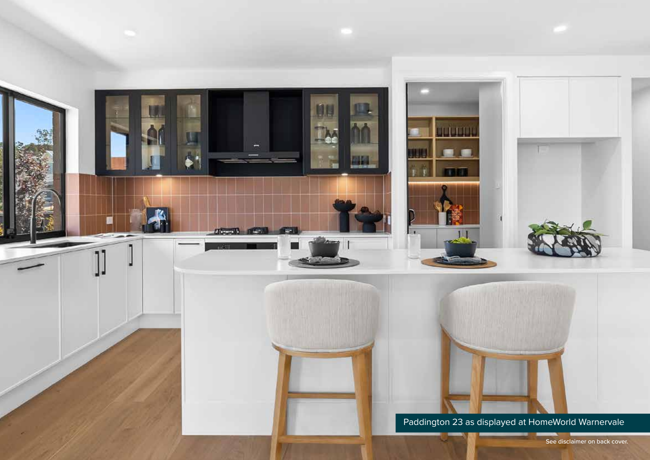
Paddington 23 as displayed at HomeWorld Warnervale