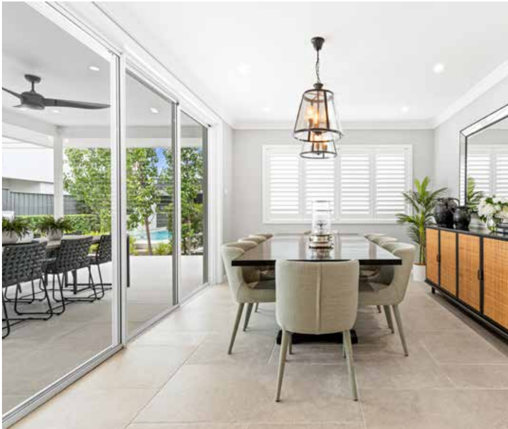
Three (3) Panel Aluminium 2100mm High Stacker Door (if applicable to design)