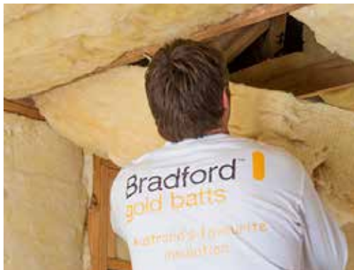
Bradford R4.0 Glass Wool Ceiling Insulation Batts (excludes garage, porch & alfresco)