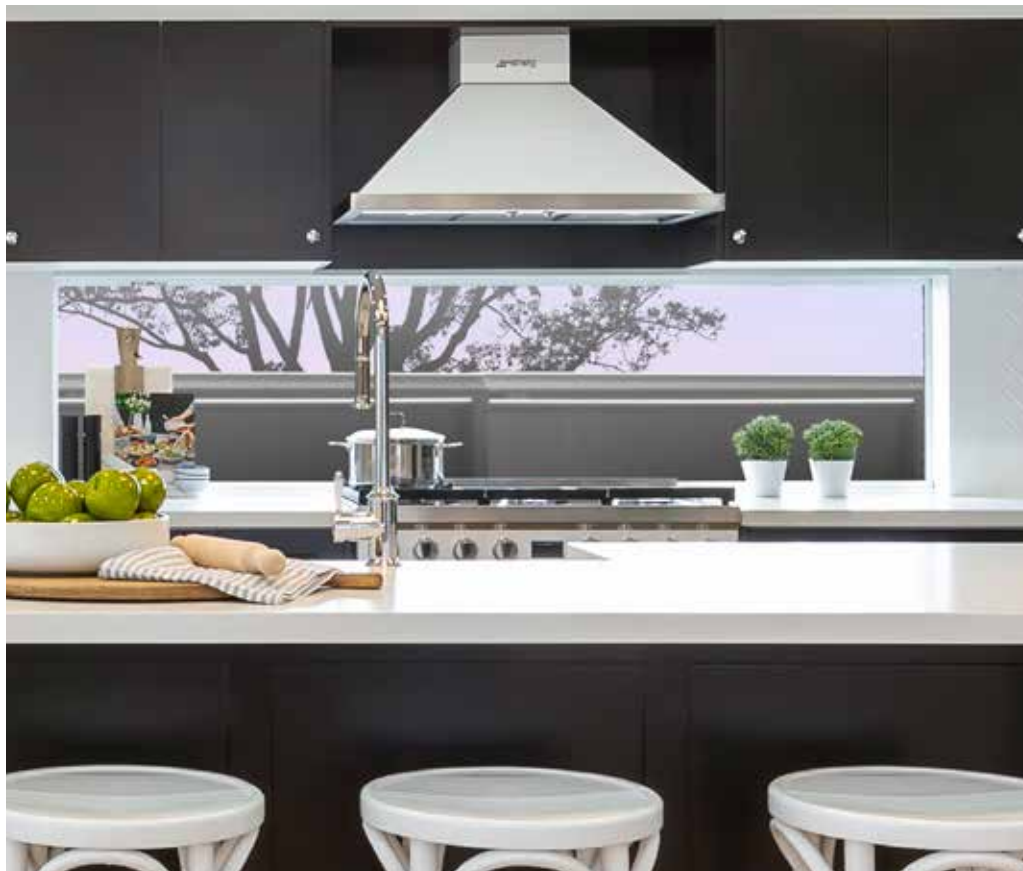
Laminated overhead cupboards on either side of rangehood in flat profile finish