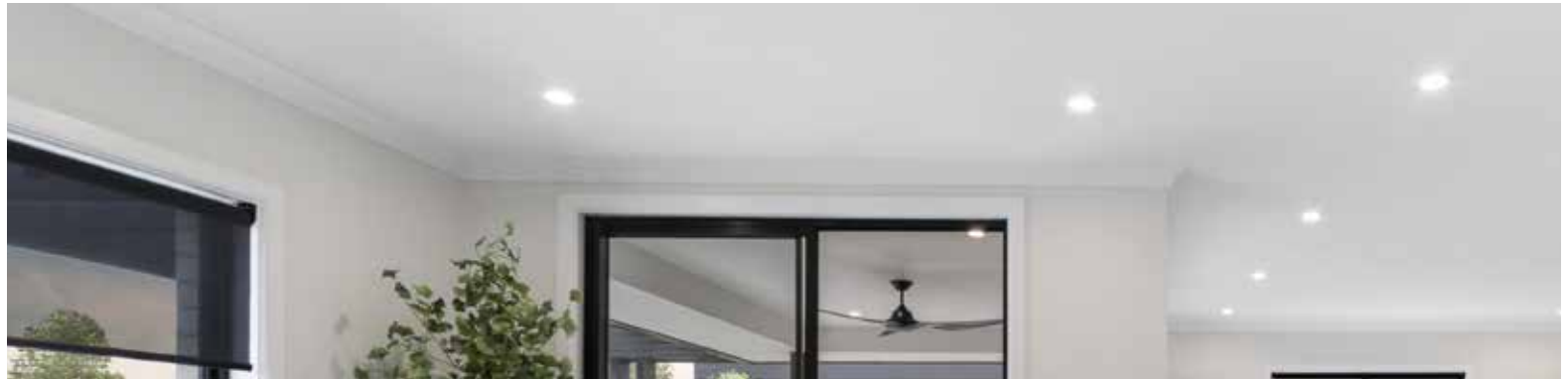
Decorative Cornice to Living Areas