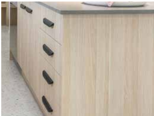
Bank of Four (4) Drawers in range of builders colours