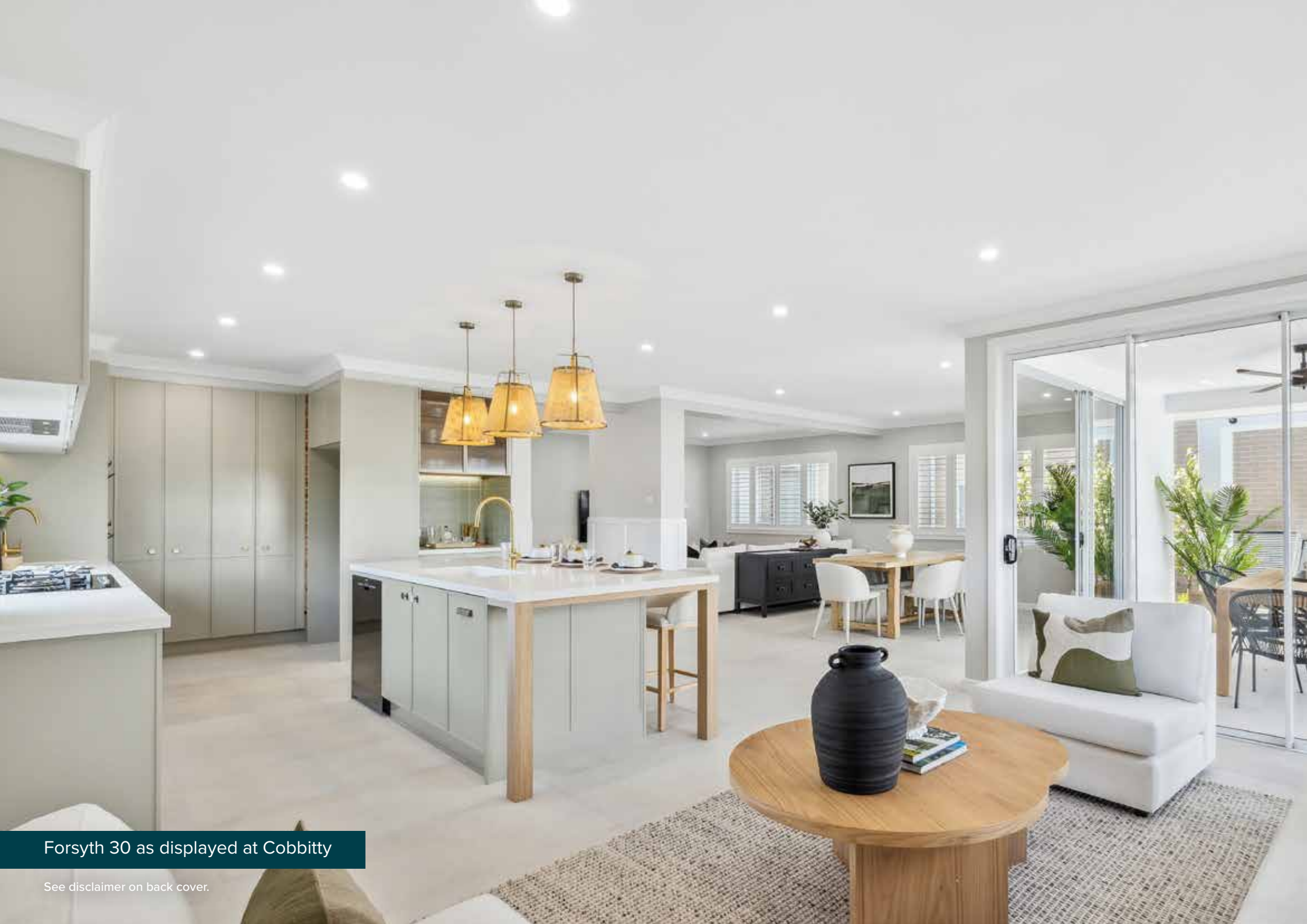
Forsyth 30 as displayed at Cobbitty