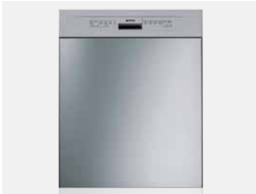
SMEG 600mm Stainless Steel Dishwasher