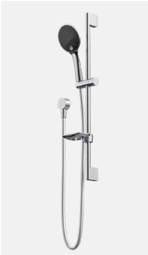
Caroma Pin Multifunction Shower Rail to Ensuite