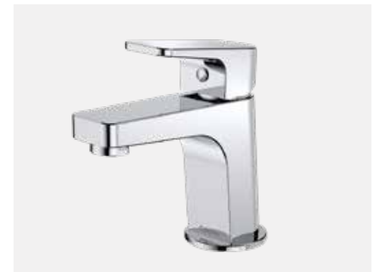
Caroma Morgana Mixer Tapware to Ensuite, Bathroom & Powder Room (if applicable)