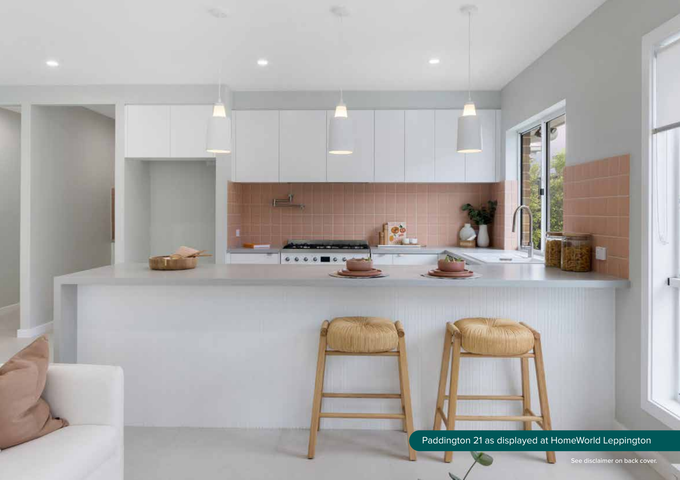
Paddington 21 as displayed at HomeWorld Leppington