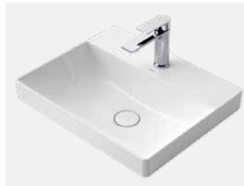
Caroma Urbane II Inset Vitreous China Vanity Basin