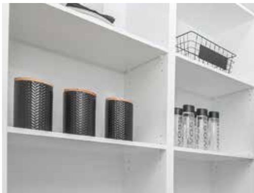
White melamine shelving to pantry