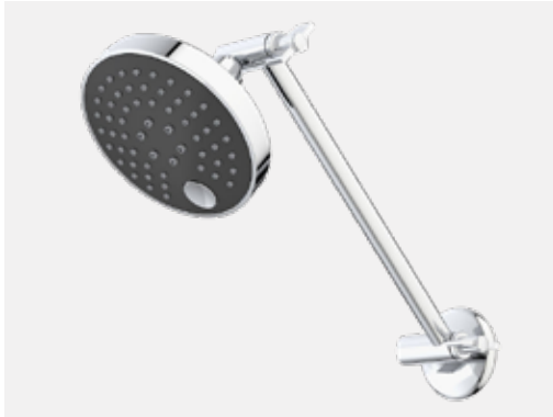
Caroma Pin Multifunction Shower Rose to Bathroom