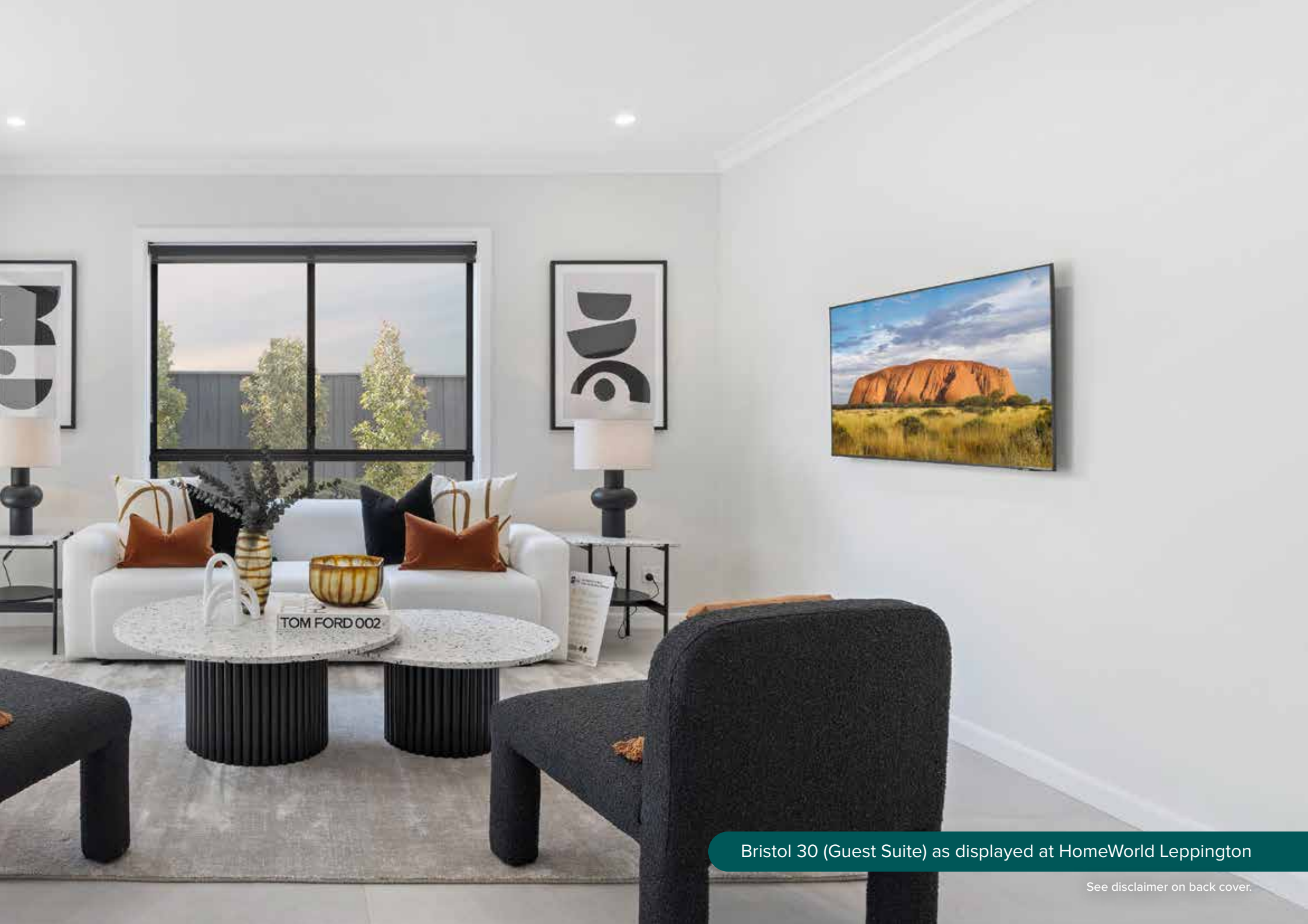
Bristol 30 (Guest Suite) as displayed at HomeWorld Leppington