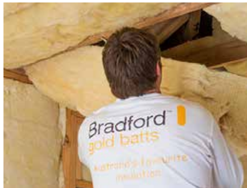
Bradford R4.0 Glass Wool Ceiling Insulation Batts (excludes garage, porch & alfresco)