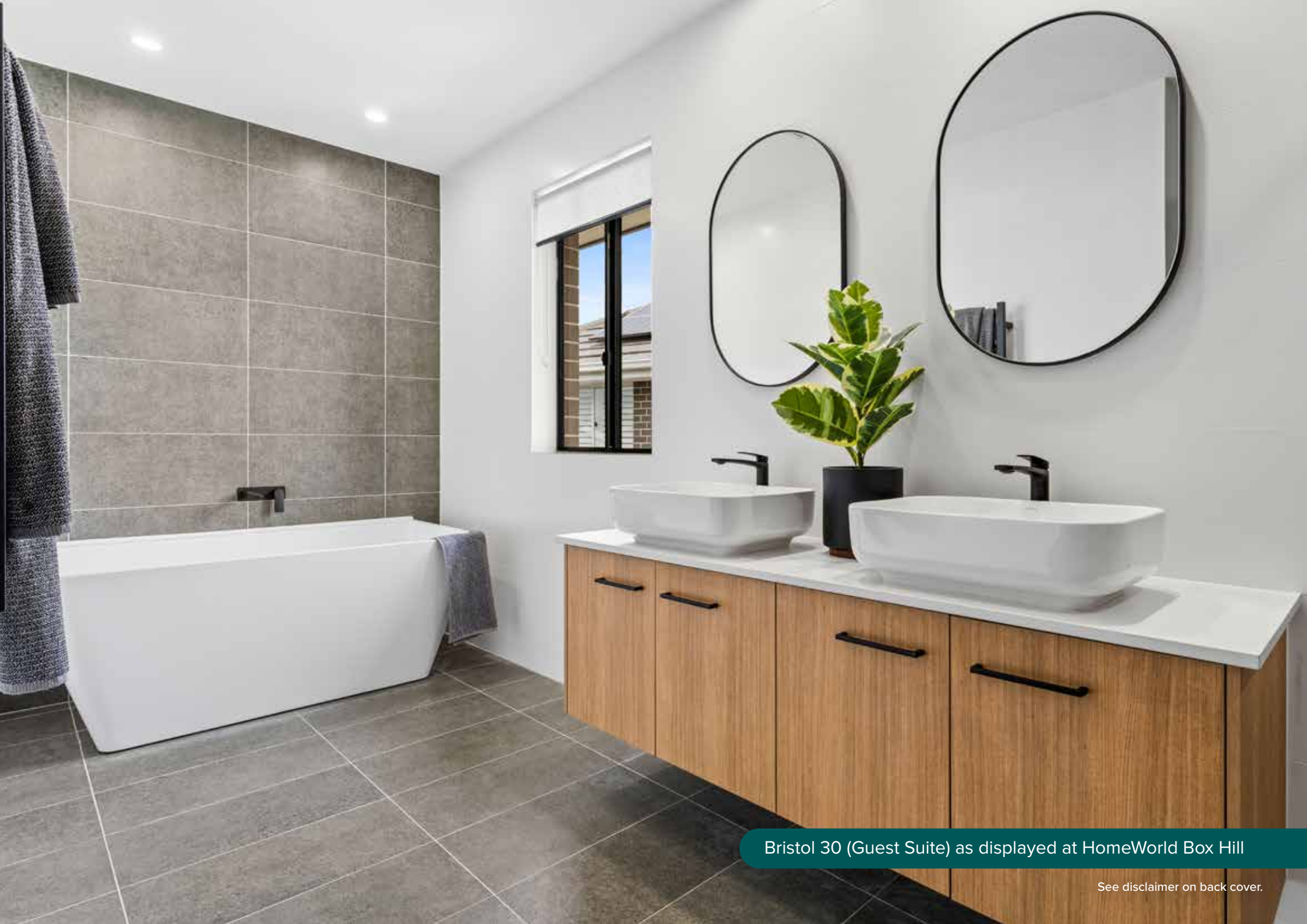
Bristol 30 (Guest Suite) as displayed at HomeWorld Box Hill