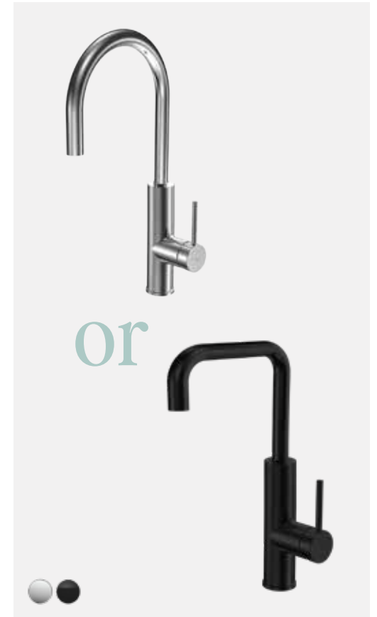
Choice of Sink Mixer in Chrome or Black