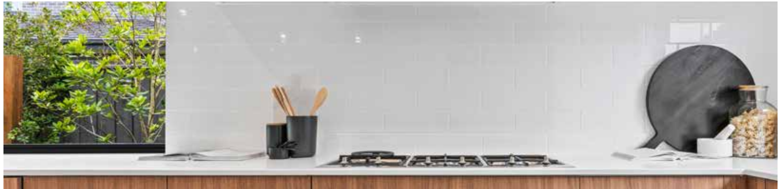
Ceramic Tiled Splashback from selected range