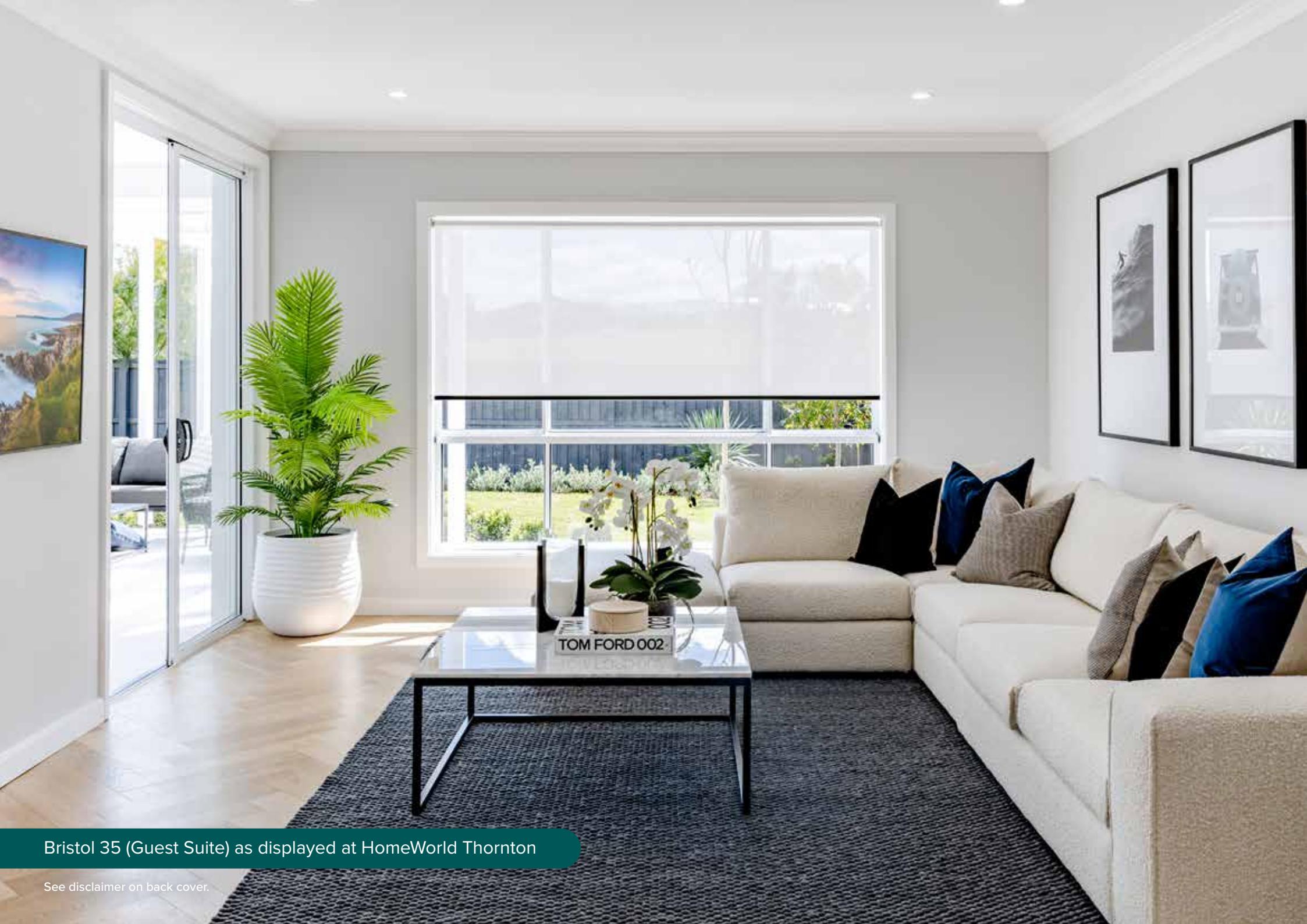
Bristol 35 (Guest Suite) as displayed at HomeWorld Thornton