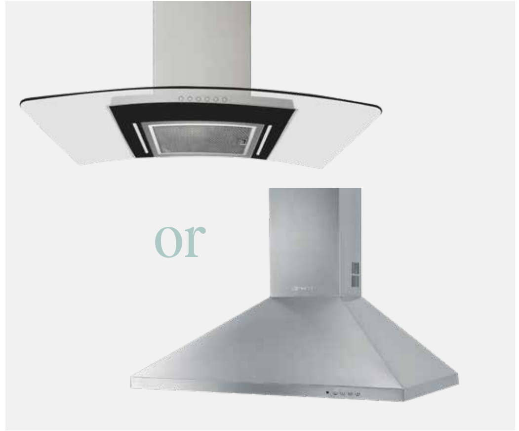
Choice of SMEG 900mm Stainless Steel Canopy or SMEG 900mm Glass Canopy Rangehood