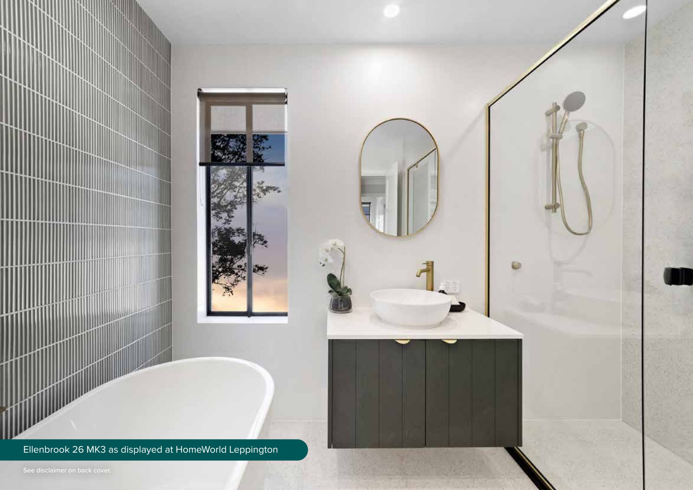
Ellenbrook 26 MK3 as displayed at HomeWorld Leppington