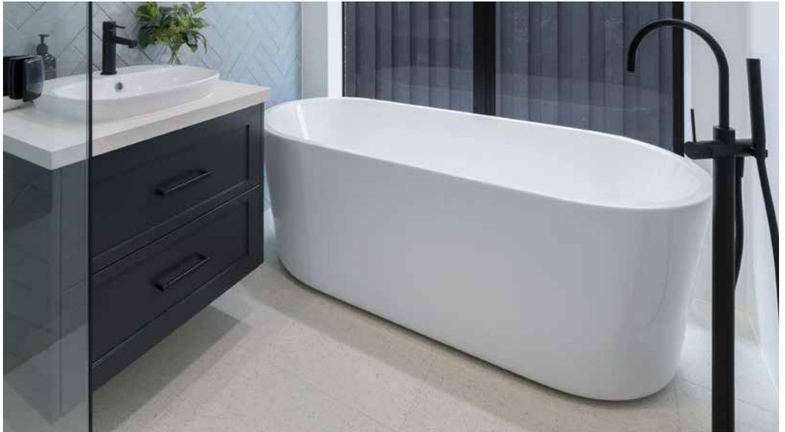
Stylus Origin Freestanding 1600mm Bath to Bathroom