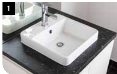
1 Clark square inset basin in 33mm Laminex benchtop.

Essential spaces like bathrooms need easy access, comfort and room to move freely. Designed for function and relaxation, bathrooms give busy families a peaceful experience with little fuss.