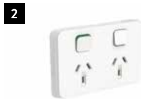
Clipsal Iconic double power points and light switches.