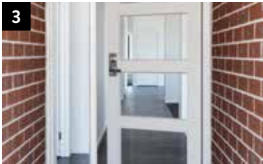
Feature entry door with clear glazing and side lights (where applicable).