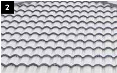
Monier roof tiles.