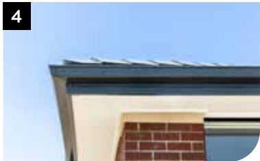
COLORBOND® fascia and gutter.