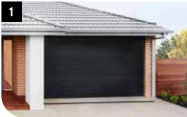
COLORBOND® steel sectional lift up door.

Each of our facade designs include varying material options to create an inviting entrance. We also carefully consider placement of windows allowing the flow of natural light throughout the home. Ample space is created by the arrangement of porches and openings to adjoining rooms, which helps to provide a warm, homely and secure feeling.