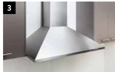
Technika 900mm stainless steel canopy rangehood.