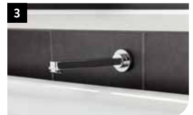
3 Alder wall bath outlet.