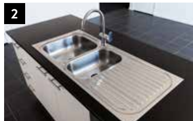
Clark 1 3/4 bowl stainless steel sink.