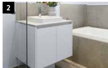
2 Fully lined cabinetry.