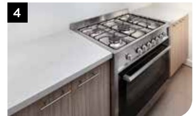
Technika 900mm stainless steel dual fuel cooker.