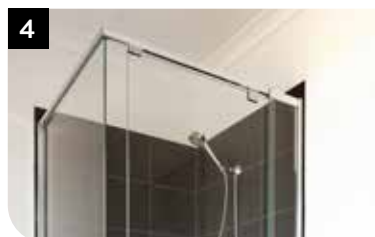
4 Semi-framed clear glass pivot shower doors, with ceramic tiles to shower recess.