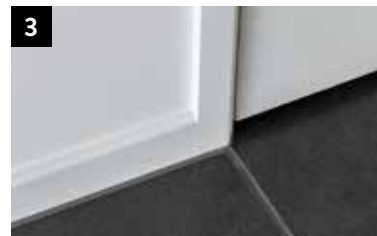
67mm x 18mm skirting & architraves.