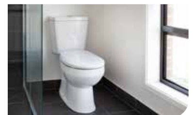
Stylus dual flush vitreous china toilet suite.