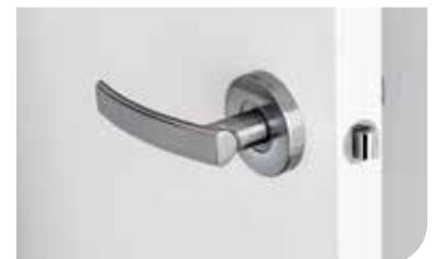
Gainsborough door handle lever passage sets.