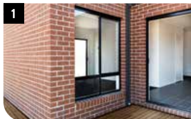
Dowell sliding aluminium key lock windows.

Living rooms are just that – space for the household to come together and live well. And when it comes to living areas, it’s all about flexibility. We consider multiple living zones creating opportunities for multi-generational use to come together and relax. Generous open plan design provides home owners with the freedom to enjoy living spaces while staying connected to all parts of the home.