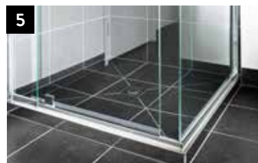
5 Ceramic tiled shower base.